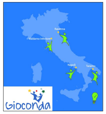
Figure 1. GIOCONDA implementation areas [1]

The final goal of the project is to provide a tool (a platform) able to connect the two parts providing also environmental data relevant for the decisions. In the first year of activity, four areas involved all across Italy: Ravenna, Valdarno Inferiore (Castelfranco di Sotto, Montopoli in Val d'Arno, San Miniato e Santa Croce sull'Arno), Napoli and Taranto (see Figure 1). In each area, two schools are involved during the first year of the project: one First Grade Secondary School, age from 11-13, and one Second Grade Secondary School, age from 14 to 18. Partners of the project are the Municipality of Ravenna, the Environmental agencies of Emilia Romagna and Puglia (ARPA Emilia Romagna and ARPA Puglia), one of the University of Napoli (Università Suor Orsola Benincasa Napoli) and the Health Society of Valdarno Inferiore (Società della Salute Valdarno Inferiore). The coordinator is the Institute of Clinical Physiology of the National Research Council (IFC-CNR).